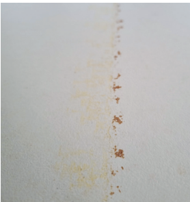
Dissolved residues and dirt adhere to surface of the first pressed standard melamine film after cleaning procedure