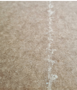
Cleaning film after pressing