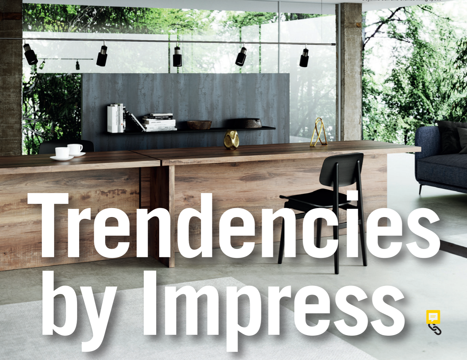
Bayonne Oak and Uranus living space